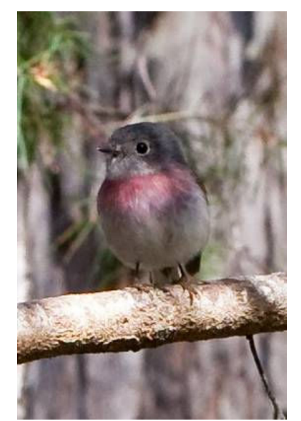
Rose Robin (female)