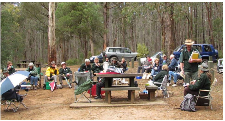
Ringwood Field Naturalist group enjoying lunch at Kurth Kiln, Beenak