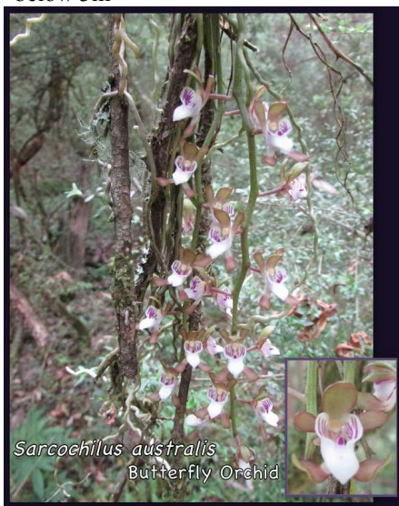
Sarcochilus australis Butterfly Orchid Club field trip Morwell SP 16 November 2013

Family : Orchidaceae Scientific Name : Sarcochilus australis Common Name : Butterfly orchid Height : Epiphyte - usually below 3m