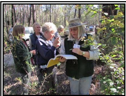
Members working on plant identification during the Club's Spring field weekend at Lake Tyers in September 2013