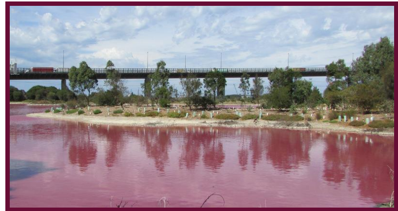
Salt Water Lake, Westgate Park

Following the January Field Trip to Jam Jerrup, several members took the opportunity to visit The Gurdies Nature Conservation Reserve nearby and were pleased to find several good specimens of this orchid in flower. This species grows in south eastern Australia. Plants may be up to 50 cm tall. The large green lanceolate leaves arise from the base. Flowers appear October to March.