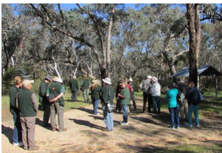
Members gather at Rise and Shine Reserve on Sunday of the Newstead weekend