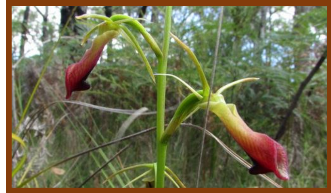
Cryptostylis subulata (Large Tongue Orchid)

Following the January Field Trip to Jam Jerrup, several members took the opportunity to visit The Gurdies Nature Conservation Reserve nearby and were pleased to find several good specimens of this orchid in flower. This species grows in south eastern Australia. Plants may be up to 50 cm tall. The large green lanceolate leaves arise from the base. Flowers appear October to March.