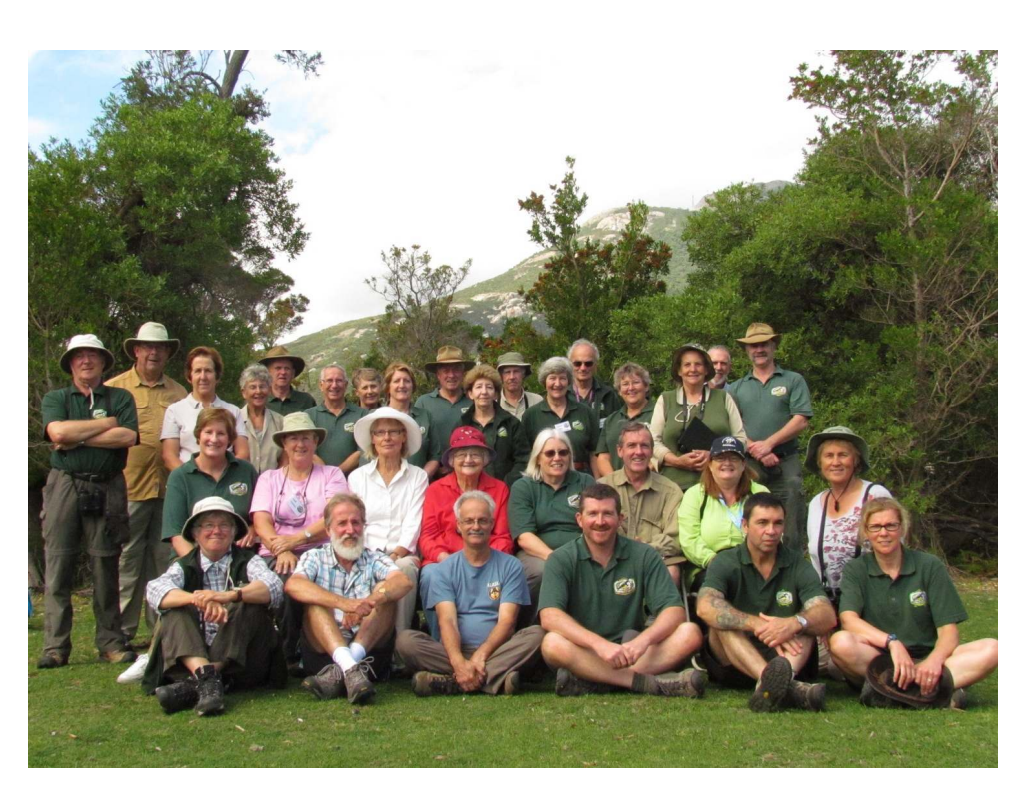
Club weekend away to Yanakie - 31 members attended.