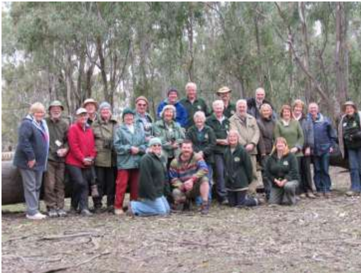
Echuca Weekend Away – May 2011