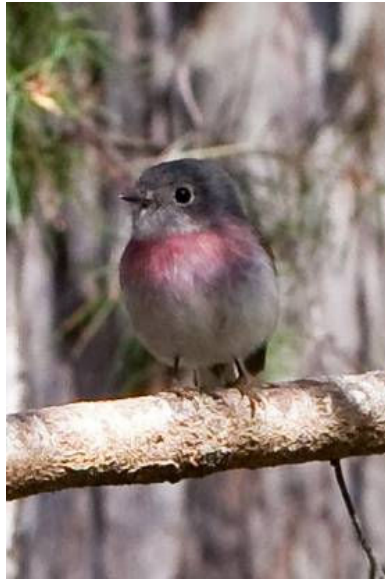
Rose Robin (female)

Photos from Kurth Kiln (Beenak) excursion 2012