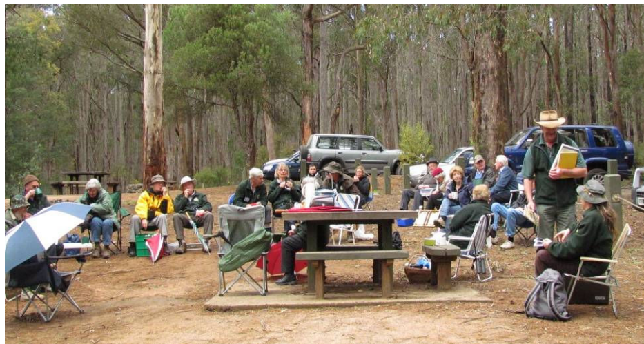
Ringwood Field Naturalist group enjoying lunch at Kurth Kiln, Beenak