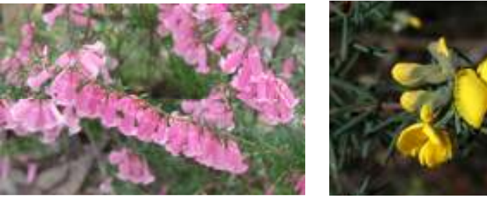
Epacris impressa (Pink heath)