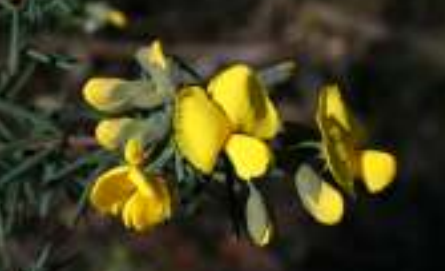
Gompholobium huegelii (Common Wedge-pea)